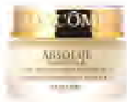
Lancôme Absolue Premium Be Advanced Replenishing Cream, £81