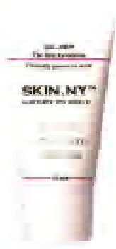
Skin NY Radical Restoration Complex, £90