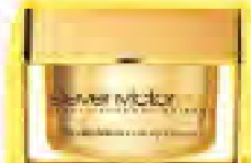
Sternoc-HS SO-NUTRIUM LUXURY CREAM, £110