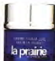
La Prairie Skin Care Line Cream, £254