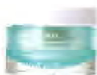
YSL Hydra Feel Care/et Hydrating Water Crème, £32