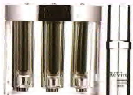
Drôme de La Mer The Firmess, £1,500